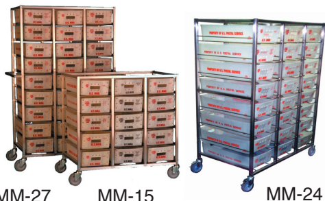
MM-27 MM-15 MM-24